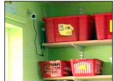
Webcams have been installed at several nurseries across the country